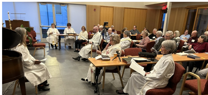
The nave for our Easter Vigil meal service

We had tables into the nave during Holy Week, principally to facilitate our Good Friday meditation time and our Easter Vigil meal. What I discovered is that some of you were better able to deal juggling books and the like with the help of the tables. So I asked the Vestry if we could use a mix of table seating and regular chair seating in the nave for a limited amount of time on a trial basis. While not everyone is a fan of this plan, in true Resurrection style, the Vestry agreed to "try it" after Pentecost