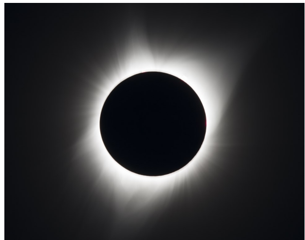
April 8 total solar eclipse

Psalm 19:1 tells us "The heavens declare the glory of