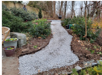
Path to the new seating area in the southwest corner of the garden

some of the cost of hardscaping were gifts of Goodwin House Alexandria, which owns the property on which most of our shared Memorial Garden sits.