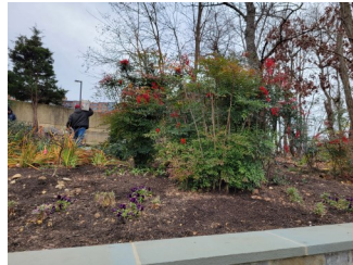
Two new holly bushes, before the snow storm in January

the many, many people who have contributed money to support this project.