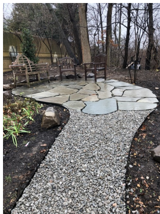
The new seating area

There also now is a storage bench near the wall of the Goodwin House parking garage that forms the back wall of the garden. The bench is hand for sitting and stores garden tools near to where they are needed.