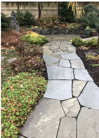
The new flagstone path to the center of the garden

The hardscape in our Memorial Garden now includes a newly laid flagstone path into the center circle. The benches that usually are there haven’t yet been returned, but it makes a very nice seating area. The new flagstone path looks great and is easy to walk on.